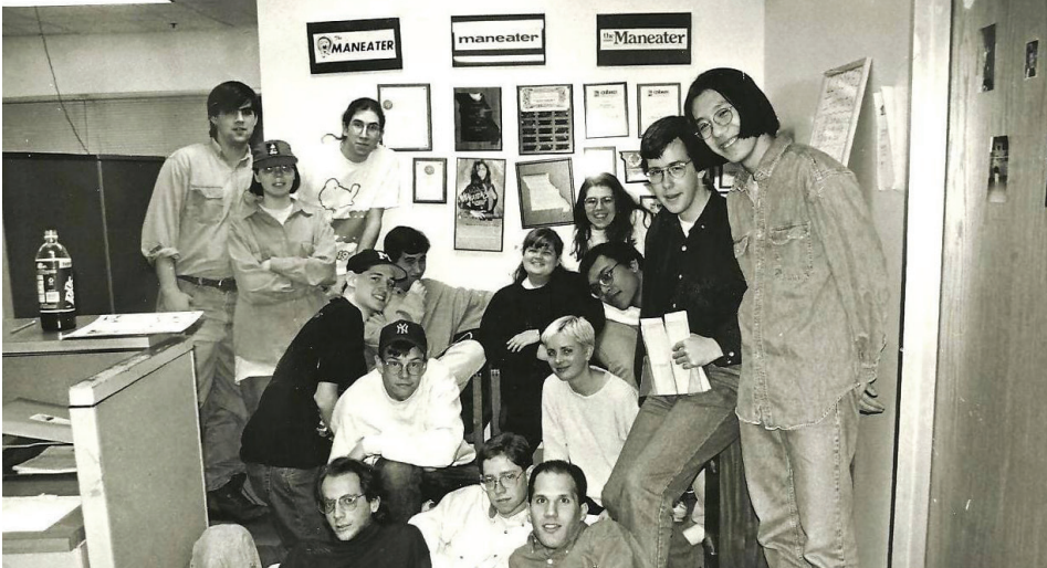
Staffers pose for a photo in The Maneater newsroom.