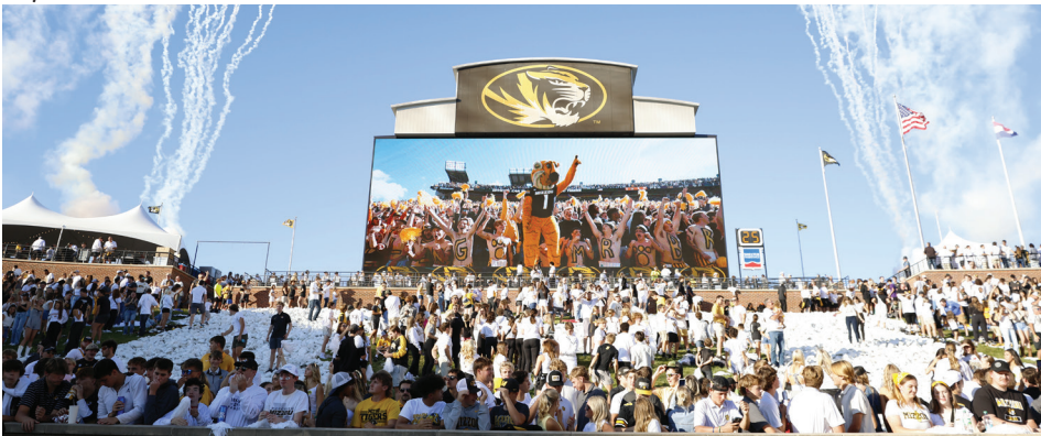
Fireworks go off ahead of the Tigers’ game on Saturday, Sept. 7, 2024 at Faurot Field in Columbia.