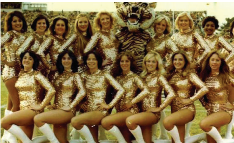
Truman and the Golden Girls pose for a photo in 1976.